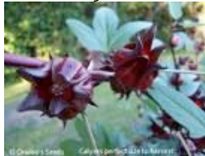
kardady, rose hibiscus